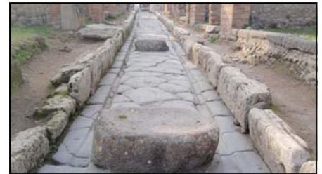
Wagon Wheel ruts on a Pompeii street that are hundreds of years old