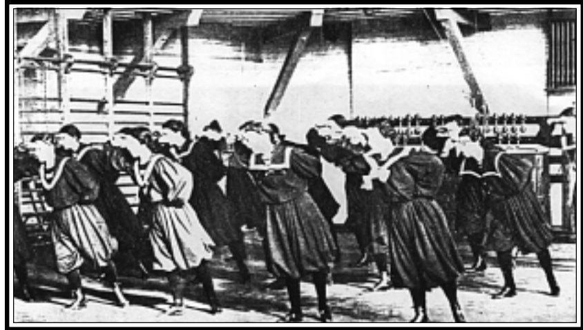
Posing in Physical Culture, 1908

The English-scientific course, German language based course, and Latin based course required 4 years work. After teaching for eight months, the recipient was eligible for a life certificate to teach in Wisconsin in any public primary, grammar or high school. These courses of study also prepared students for the last two years of college work at a state university.