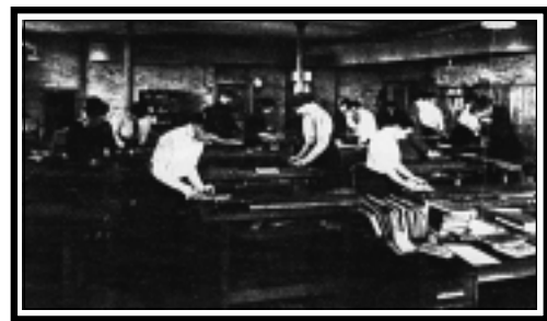
Manual Training Class

Courses in Home Economics were available and Industrial Arts was now part of the curriculum. The Board of Regents of Normal Schools had required this new emphasis on manual training, because it believed that education has for its chief purpose, the development of those powers of the individual that may be effective for useful ends. The child was recognized as a "tool using animal", and yet the system of education in vogue for the past hundred years had neglected to teach the use of various tools and processes until manual training was placed in the curriculum. The course was distinctly educational aiming to train children into the "utmost possible largeness of being for the utmost possible service". Side effects would be to meet immediate personal needs and provide for future trade work. Manual training would supplement other subjects through the construction of models to illustrate those subjects; bring school and home into closer harmony through the construction of articles of real value and use in the home; bring the pupil into touch with the industries of the world through the study of typical methods of manufacture and through the transformation of rough materials into finished products; develop good taste in home furnishings and an appreciation of good workmanship and honest construction; and arouse the child's interest in school work through problems enlisting both mind and hand.