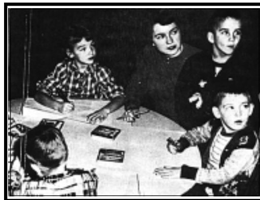
Learning to Teach

Towards the end of the decade, for the intermediate and upper-grades curriculum, the student took physical education, English composition courses, art, biology, geography, music, physical science, speech, six credits of history, six credits of literature, teaching of art, children's literature for the upper elementary grades, physiology and hygiene, play activities for boys and girls, and teaching of social studies in the intermediate and upper grades. Some methods courses previously taught out of education were now in education. Education courses included: child psychology, introduction to elementary education, teaching arithmetic in elementary grades, teaching reading in the upper grades and junior high school, upper grade methods (learning to understand the early adolescent and his problems; methods and materials used in modern practice, application of general principles of teaching to specific learning situations; organization and administration of the self-contained classroom), and student teaching. A three year curriculum was still available and was handled as for the three year kindergarten-primary curriculum. In neither the kindergarten-primary or intermediate-upper grade curricula was there now a required course in teaching science. The methods course would be taken if a science minor was added. A speech minor was also available.