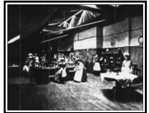
Cooking Laboratory, 1903

Teachers were also taking courses in agriculture (10 weeks) and nature study to prepare them to teach. An elective course in domestic science was also added. Cooking and housekeeping were covered and the study of the scientific reasons for each process. In the Training Department school domestic science aimed to awaken an interest in such work in the girls and a liking for it and to cultivate an appreciation of its value and importance as well as an insight into the requirements of the finer, more cultivated side of social intercourse.