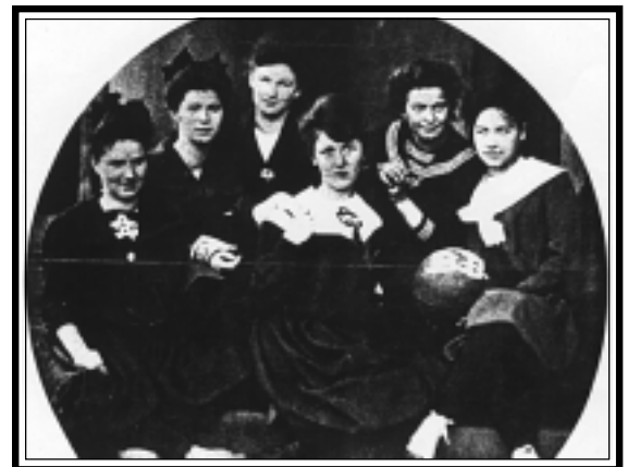
Girls Basketball Team, 1909

1903 also saw the first mention of the kindergarten in the Training Department. In 1909 the second normal school training course for kindergarten teachers in the state was inaugurated at Superior and became a major contributor to the outstanding reputation for teacher education at the Normal School. A kindergarten room was added to the main building with a play room having a good sized sand-pit and floor building blocks. The kindergarten course of study developed theory with an emphasis on Froebel's Mother Play and plays and games. The course description states that it had become necessary for the progressive teacher to follow race development as a basis for the study of the individual child, not only by the study of primitive industries, customs and folk