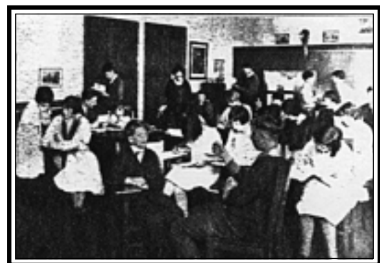
Normal School at work on Contract

The College believed in an activity curriculum which centered around the experiences of the child. Education should be emotional as well as intellectual. Teaching must be dramatic or sensational. Each individual was entitled to the fullest possible development. Character development was believed in, through clubs and assemblies, and in making monthly reports personality traits as well as actual scholastic achievements were rated. One of the important requirements society places upon modern education was that of training for proper use of leisure time. Also since one of the great problems for all people in connection with education was to steer between unwise educational practices on the one hand, and over conservative practices on the other, it was always the aim of the