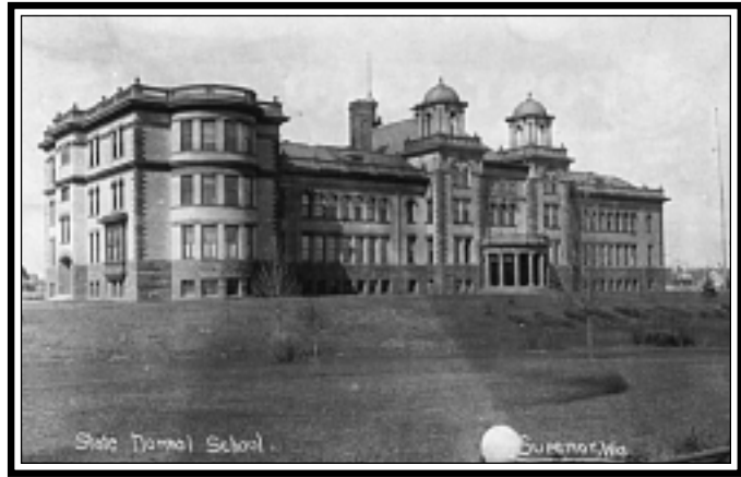
State Normal School, 1898

In describing the reasons for why a person would want to attend a normal school to become a teacher, the catalogs from the first years spoke of the opportunity to mix with young ambitious people who came from many parts of the country and who would be a source of great inspiration, as well as being able to come into contact with teachers chosen for their ability to teach, for their judgments matured by experience, and for their unquestioned integrity. A student would also gain that mental and moral training that would give one a high place among his fellow men and commend him to those pursuits which look to the advancement of all human interests. He would become acquainted with the laws of mind growth, gain a knowledge of the history of education, and secure a recognized legal standing in the profession.