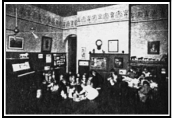
Kindergarten Class, 1903