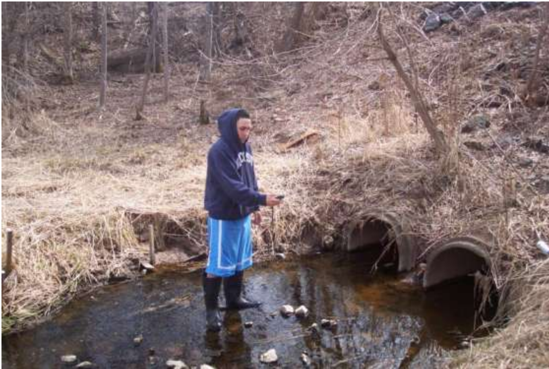
Handheld GPS used to capture sampling location at Newton Creek

Who should attend: Faculty or staff interested in using GPS to capture spatial data and create teaching materials for a fall 2010 course or for research.