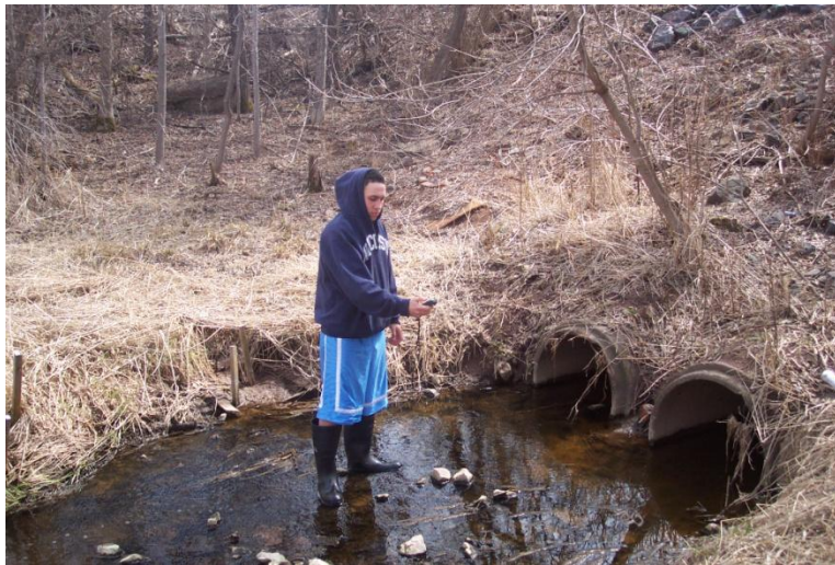
Handheld GPS use to capture sampling location at Newton Creek

Who should attend: Faculty or staff interested in using GPS to capture spatial data and create teaching materials for a fall 2010 course or for research.