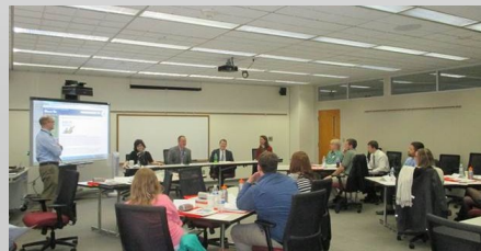
Wisconsin DOT Leadership Panel Interacting with UW-Superior students.