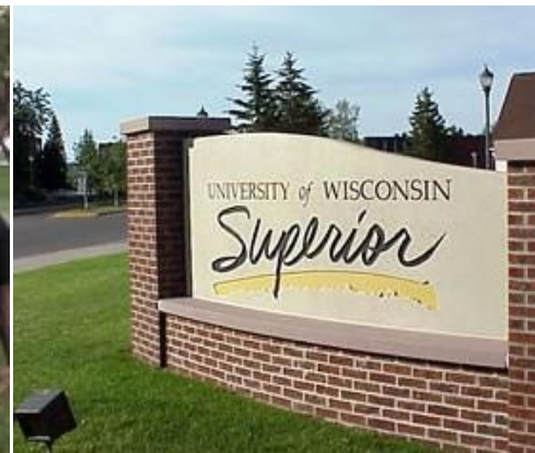
UW-Superior Entrance Sign

This combined UW- Superior Annual Campus Security and Fire Safety Report – 2014 addresses two annual reporting requirements required by the Department of Education as referenced in Title 34 of the Code of Federal Regulations, Part 668, and the final rule published October 29, 2009 in the Federal Register, section 668.44: