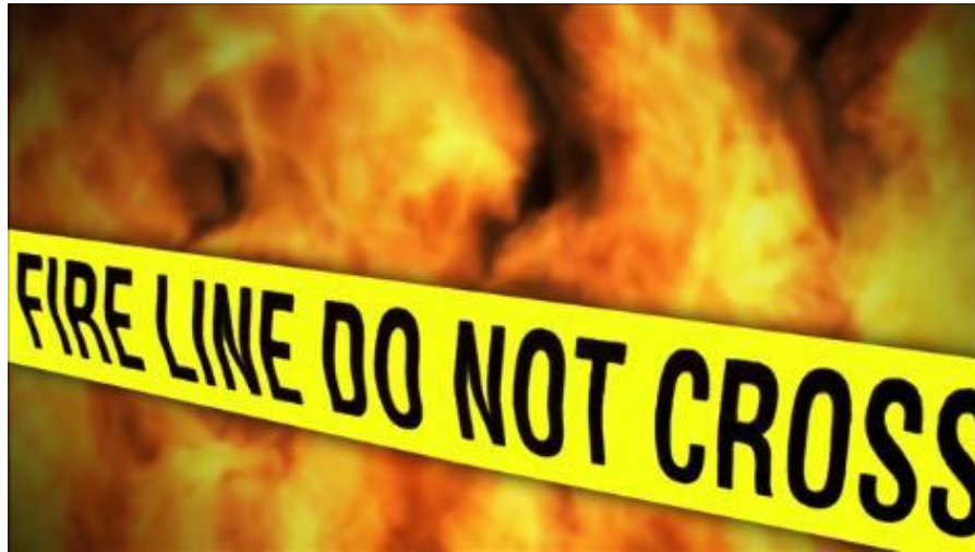
Table 3 below summarizes the number of fires, the number of fire related injuries requiring medical treatment, number of fire related deaths, and the property damage caused by fire for each of the UW Superior residence halls for the years 2011-2013. Included with the statistics are the numbers of fire drills held in the calendar year for each residence hall.

Four residence hall fires were logged during the 2011 - 2013 reporting period. Damages were very minor and there were no injuries or deaths that resulted. The fire in 2011 was the result of food burning in a microwave oven creating a lot of smoke. The only damage was contained to the microwave oven that had a replacement cost of $50.