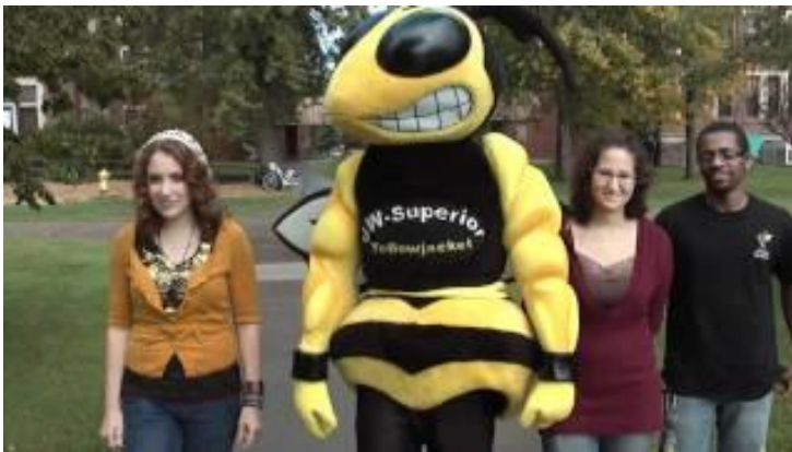
B.U.Z.Z. mingling with students on campus