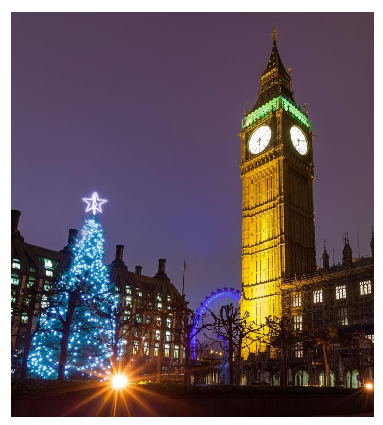
7 Days • 8 Meals: 5 Breakfasts, 1 Lunch, 2 Dinners

HIGHLIGHTS... Buckingham Palace, Harrods at Christmas, Big Ben, Christmas Markets, Covent Garden, Traditional English Tea, London Theatre, Oxford, Blenheim Palace, Westminster Abbey